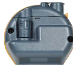
Quikstick ST POL8751, standard with all MMS2 kits and with the same performance as the standard Quikstick. A Quikstick ST can remain connected to the MMS 2 while using the pins.

Readings from multiple Hygrosticks can be taken and recorded with ease. Humidity readings can be taken with the use of humidity sleeves or humidity box. Hygrosticks, not Humisticks, should be used for this test.