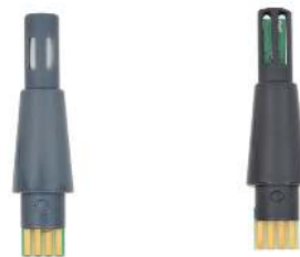
Hygrostick part number POL4750, for high moisture applications.