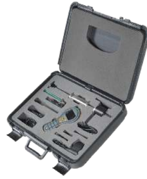
MMS2 Hard Carry Case Kit