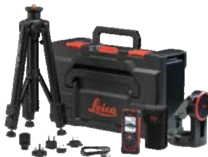
Leica DISTO™ D5 Package Art. No. 950879

Leica DISTO™ D5, Pouch, USB-C to USB-A Cable, Hand Loop, Quick Start Guide, Warranty card, Safety Manual, Calibration Certificate Silver