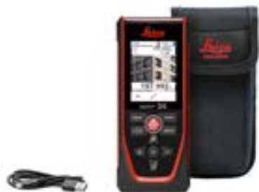
Leica DISTO™ D5 Art. No. 950908

Leica DISTO™ D5, Pouch, USB-C to USB-A Cable, Hand Loop, Quick Start Guide, Warranty card, Safety Manual, Calibration Certificate Silver