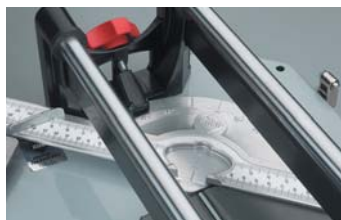
Angular measuring system