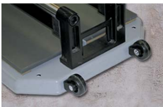
Wheels Kit. (TX-1200-N).