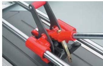
Chromed and rectified steel guides