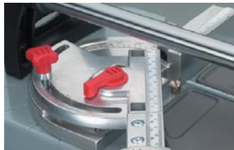
Angular measuring system